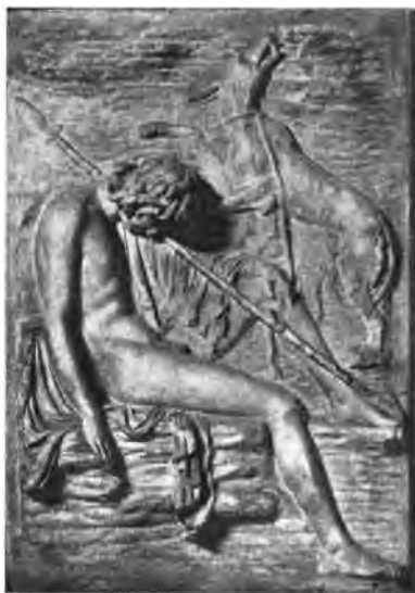
Fig. 23. Sleeping Endymion.

Once even the maiden Artemis loved a mortal. Endymion. En dym'i on was a shepherd who kept his flocks